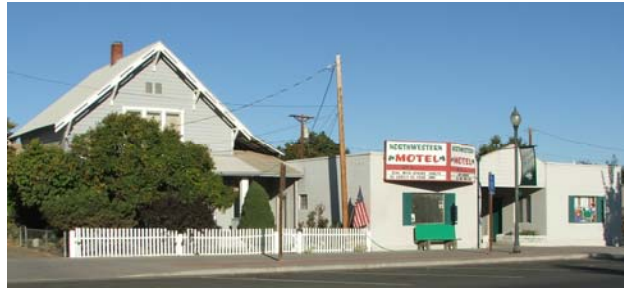
The Northwestern Motel & RV Park is located on Main Street in Heppner. Check out their great rates and accommodations!